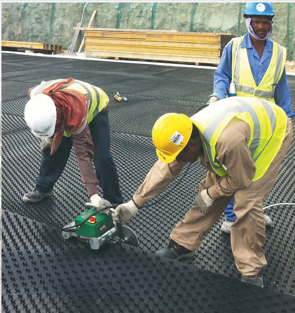
The ASTRO CPL; overlap welding.

A customized automated machine has been developed The difficulty when connecting the individual sheets in the protective liner is welding them rationally. Leister Technologies AG has developed a special automatic welder for this. The tried and tested hot wedge welder ASTRO was retrofitted so it runs smoothly between the nubs and can weld the overlapping sheets. The ASTRO CPL (Concrete Protection Liner) runs at 1.5 to 2 meters per minute over the 3 mm thick PE sheets. It connects the stiff PE material with its maximum contact pressure of 1500 N securely and without problems.