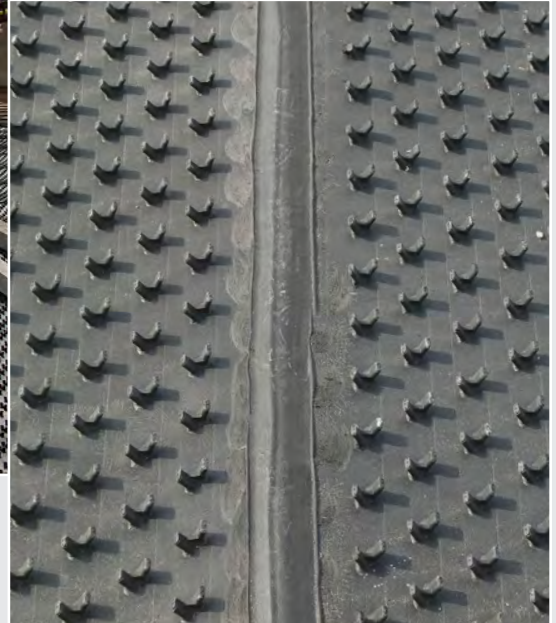
A seam that has been cleanly welded with the FUSION 3 extrusion welder.