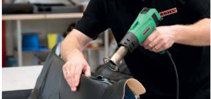
SOLANO AT - Difficult leather parts - safe and efficient processing