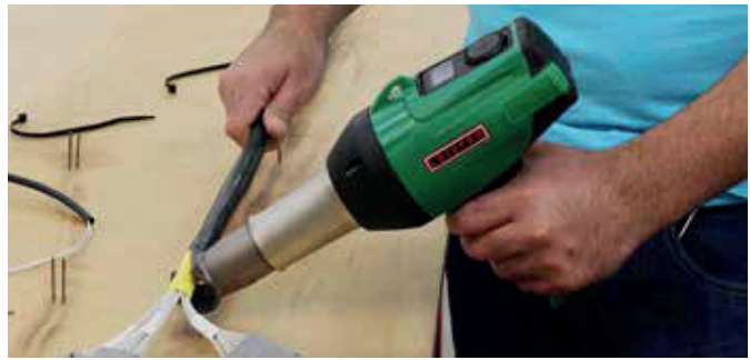
Shrink applications in cable manufacturing – ideal with the GHIBLI AW

practical device suspension make working easier. The air filters can be readily removed and cleaned. And of course, all of the nozzles from its predecessor fit the new GHIBLI AW.