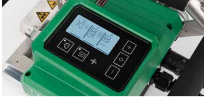
Display TWINNY T5