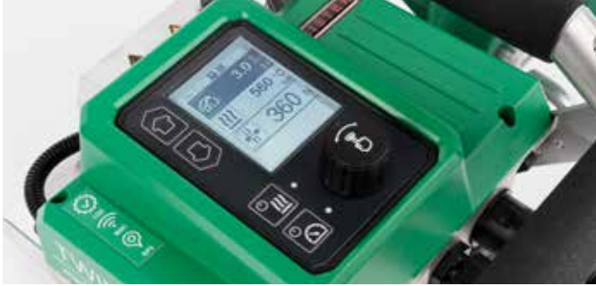
Display TWINNY T7