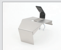
Pre-heat reflector Article No.: 136.231