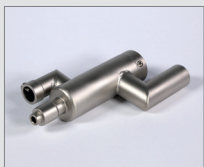
Nozzle extension Article No.: 152.720