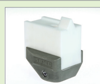
V-12 EA V-seam, 12 mm Article No.: 146.243