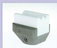
CO-10 EA Corner outside, 10 mm Article No.: 146.644