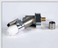
Angled adapter 45° Article No.: 153.143