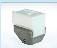
UBL-25 EA Overlap seam, 25 mm Article No.: 146.241