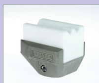
CO-8 EA Corner outside, 8 mm Article No.: 146.642