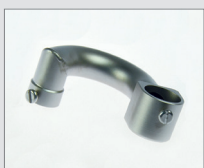
Top hot-air guide Article No.: 149.600