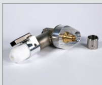
Angled adapter 90° Article No.: 153.236