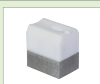
V-5/6 EA V-seam, 5/6 mm Article No.: 149.383