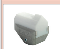
K-12 EA Fillet weld, 12 mm Artikel-Nr.: 146.252