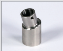
Hot-air tube, position 6h Ø 14 mm Article No.: 149.456