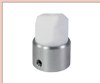
K-5/6 EA Fillet weld, 5/6 mm Article No.: 149.402

K: Shape of seam | 5/6: Material thickness | EA: External air system