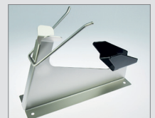
Tool rest for WELDPLAST S1 Article No.: 148.923