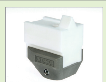
V-15 EA V-seam, 15 mm Article No.: 146.244