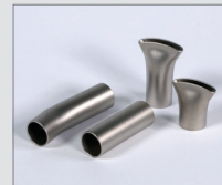
Air nozzle set Ø 14 mm (standard) Article No.: 154.107