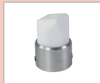
K-12 EA Fillet weld, 12 mm Article No.: 149.401