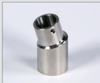
Hot-air tube, position 6h Ø 16 mm Article No.: 149.461