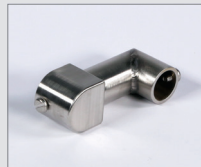
Hot-air tube, position 9h/3h Ø 16 mm Article No.: 149.469