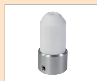
CL-14 EA Corner seam, Ø 14 mm Article No.: 149.364