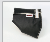
Insulation sleeve for S1 / S2 Article No.: 154.002