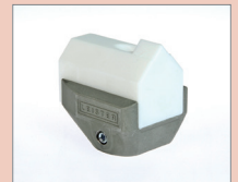
K-8/10 EA Fillet weld, 8/10 mm Article No.: 146.236