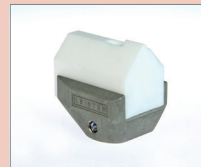
K-5/6 EA Fillet weld, 5/6 mm Article No.: 146.235