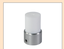
Blank Article No.: 149.430