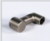
Hot-air tube, position 9h/3h Ø 14 mm (standard) Article No.: 149.467