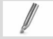
Tacking nozzle * Article No: 106.996