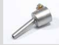
Tubular nozzle Ø 5 mm Article No: 107.144