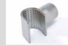
Sieve reflector 50 x 35 mm Article No: 107.308