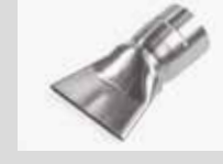
Wide slot nozzle 70 x 4 mm Article No: 107.261