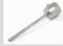
Extension nozzle Ø 5 x 130 mm, straight Article No: 107.006