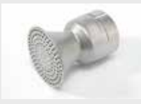
Sieve reflector Ø 65 mm Article No: 106.127