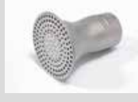
Sieve reflector Ø 65 mm Article No: 107.319