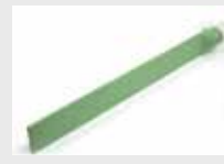
Sword-shaped nozzle (edges rounded) 74 x 12 x 520 mm, PTFE coated Article No: 107.347