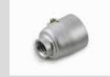
Nozzle adapter for screw-on nozzles Article No: 143.831