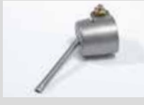
Soldering nozzle Ø 3 x 1.5 mm, oval Article No: 107.148