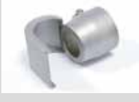
Spoon reflector 25 x 30 mm Article No: 107.313