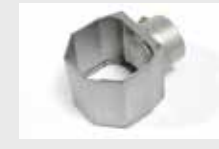
Folding reflector 60 x 75 mm Article No: 107.328