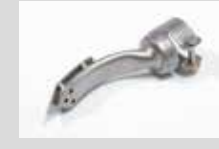
Ironing nozzle 15 x 25 mm Article No: 107.305