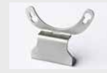
Tool stand only for ELECTRON ST Article No: 151.068