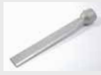
Sword-shaped nozzle 45 x 12 x 350 mm Article No: 105.961