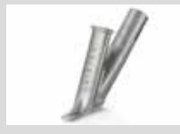
Speed welding nozzle *, triangular shaped, 5.7 mm / 7 mm Article No: 106.992 / 106.993