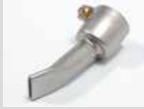
Wide slot nozzle 15 mm Article No: 107.141