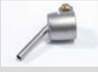
Soldering nozzle Ø 4 mm Article No: 107.151