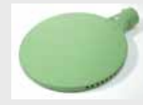
Welding mirror 270 mm, PTFE coated Article No: 107.346