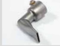
Angled nozzle 20 mm, 90° angled Article No: 105.556