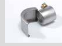
Spoon reflector 25 x 30 mm Article No: 107.312