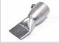
Wide slot nozzle 40 mm Article No: 106.999