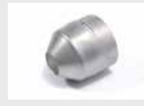
Round nozzle 20 mm Article No: 107.229