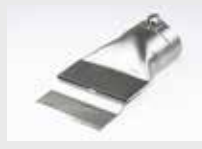
Scraper nozzle Article No: 142.281