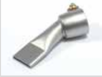
Wide slot nozzle 20 mm Article No: 107.142