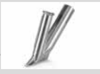
Speed welding nozzle * Ø: 3 mm / 4 mm / 5 mm Article No: 106.989 / 106.990 / 106.991 / **156.470