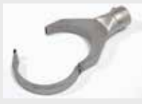
Folding reflector 125 x 22 mm Article No: 107.330