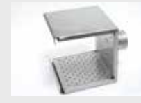
Sieve reflector 150 x 130 mm Article No: 107.333