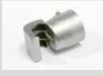
Soldering reflector 17 x 34 mm Article No: 107.325