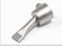
Wide slot nozzle 20 mm Article No: 106.998