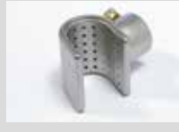
Sieve reflector 20 x 35 mm Article No: 107.310