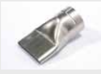
Wide slot nozzle 70 x 10 mm Article No: 107.258