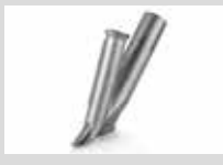
Speed welding nozzle *, with small air-slide, Ø: 3 mm / 4 mm / 5 mm Article No: 105.431 / 105.432 / 105.433