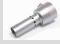
De-horning nozzle Article No: 107.007