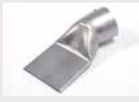
Wide slot nozzle 75 x 2 mm, Ø 50 mm Article No: 107.653