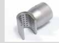
Sieve reflector 35 x 20 mm Article No: 107.309