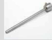
Extension nozzle Ø 5 x 150 mm, straight Article No: 105.567