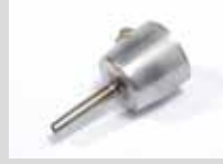
Tubular nozzle Ø 5 mm Article No: 107.154